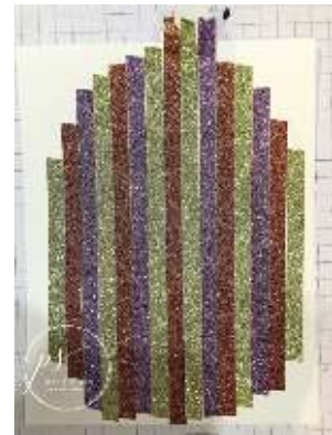
Washi tape covering the entire outline of the die. Trim this piece to fit under the aspen trees.