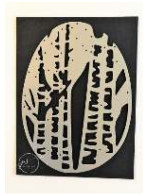
Tree die on the front ready to cut.